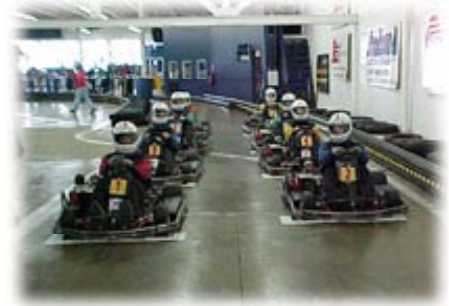
This could be you, helmet on, strapped in and ready to race!