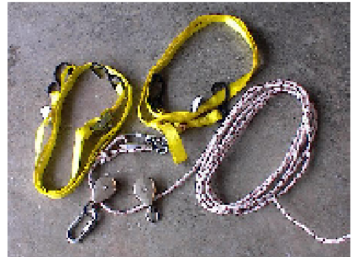
B. Top straps, pulley and rope