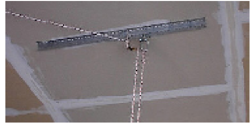
A. Angle iron on ceiling